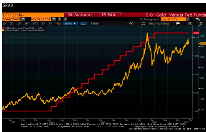
Figure 4: Spot Gold Versus Upper Band of Fed Funds Target Rate (7/4/03-3/1/07)